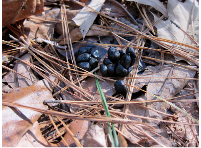
Figure 4. Deer scat