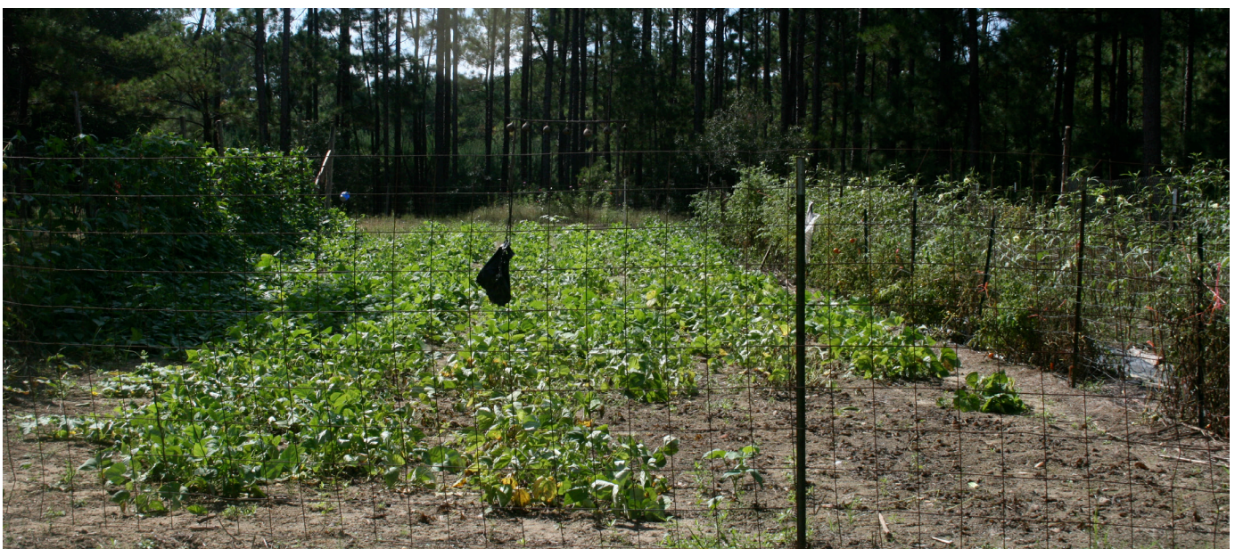
Figure 6. Homeowner fence around garden