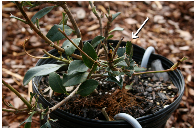
Figure 1. Deer damage to Indian hawthorn ( Raphiolepis indica )

Deer must jerk or tear plant tissues, leaving ragged edges where leaves or twigs were removed. Similar browsing animals, such as rabbits, cause damage to ornamentals as well, but they have upper incisors, which leave a smooth, clean cut. Additionally, damage caused by rabbits or other herbivores will only be found within 1 to 2 feet from the ground because of the size of these animals.