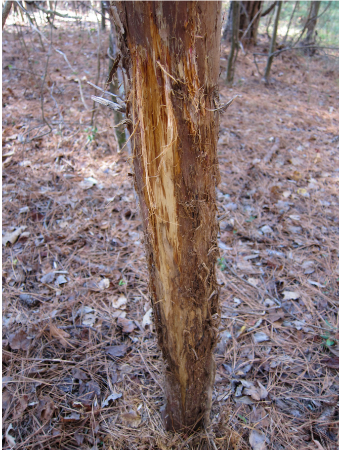
Figure 3. Deer rub on a tree