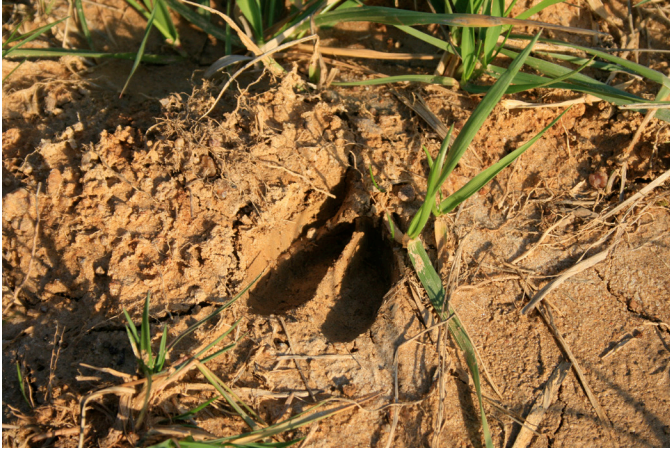
Figure 2. Deer track