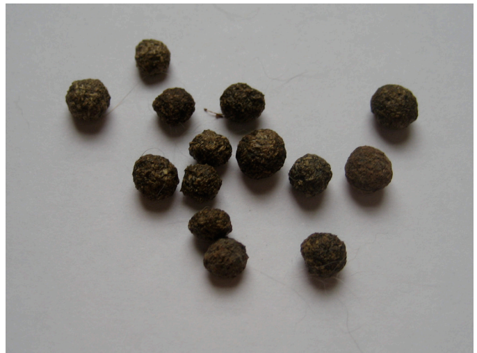
Figure 5. Rabbit scat