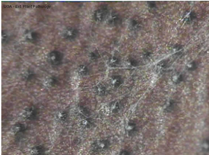
Pycnidia are light to dark brown in color and partially embedded within plant tissue. Pycnidia contain short, simple conidiophores that produce the fungal spores. Spores are extruded through an opening (ostiole) at the top of the pycnidium.