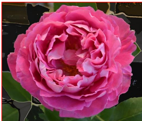
'Paul Neyron' won Best in Show!