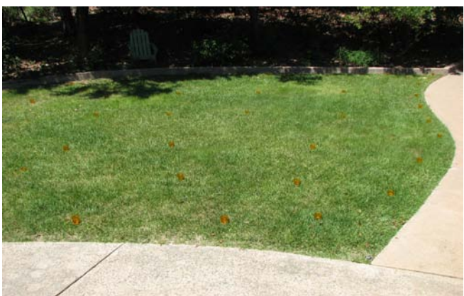
Figure 1 Irrigation measuring cup Figure 2 Measuring cups on a lawn